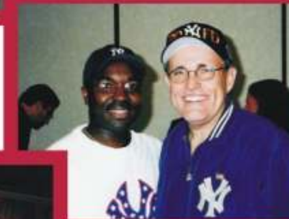
former Mayor Rudy Giuliani