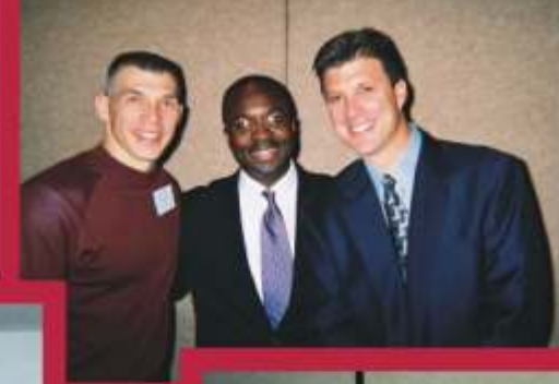
Joe Girardi and Tino Martinez